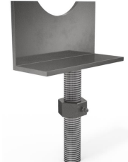
Flange Support Top

Top & U-Bolt Material Options: A-36 Carbon Steel, 304 Stainless Steel, 316 Stainless Steel, Various Alloy Materials