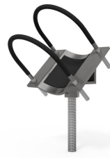
Contoured Cradle @45°