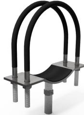
Cradle - 2 U-Bolt