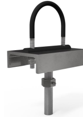
Flat Top 1 TRI-BOLT 1 TRI-GUARD