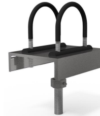
Flat Top 2 TRI-BOLTS 2 TRI-GUARDs