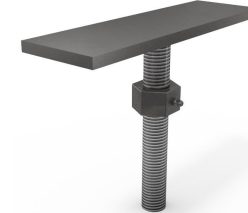
Flat Top Only